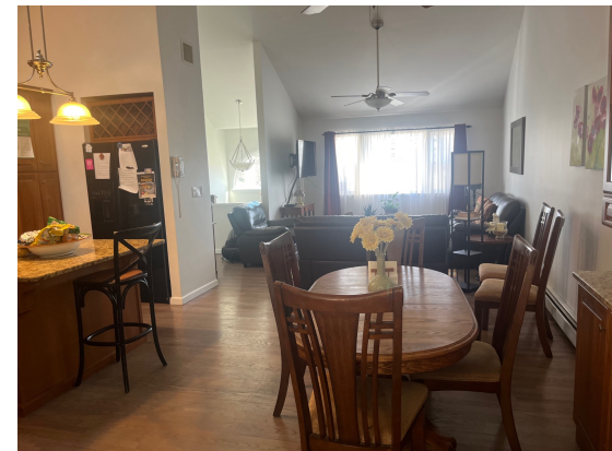
Bethany Transition House Common Areas